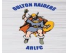
Oulton Raiders ARLFC